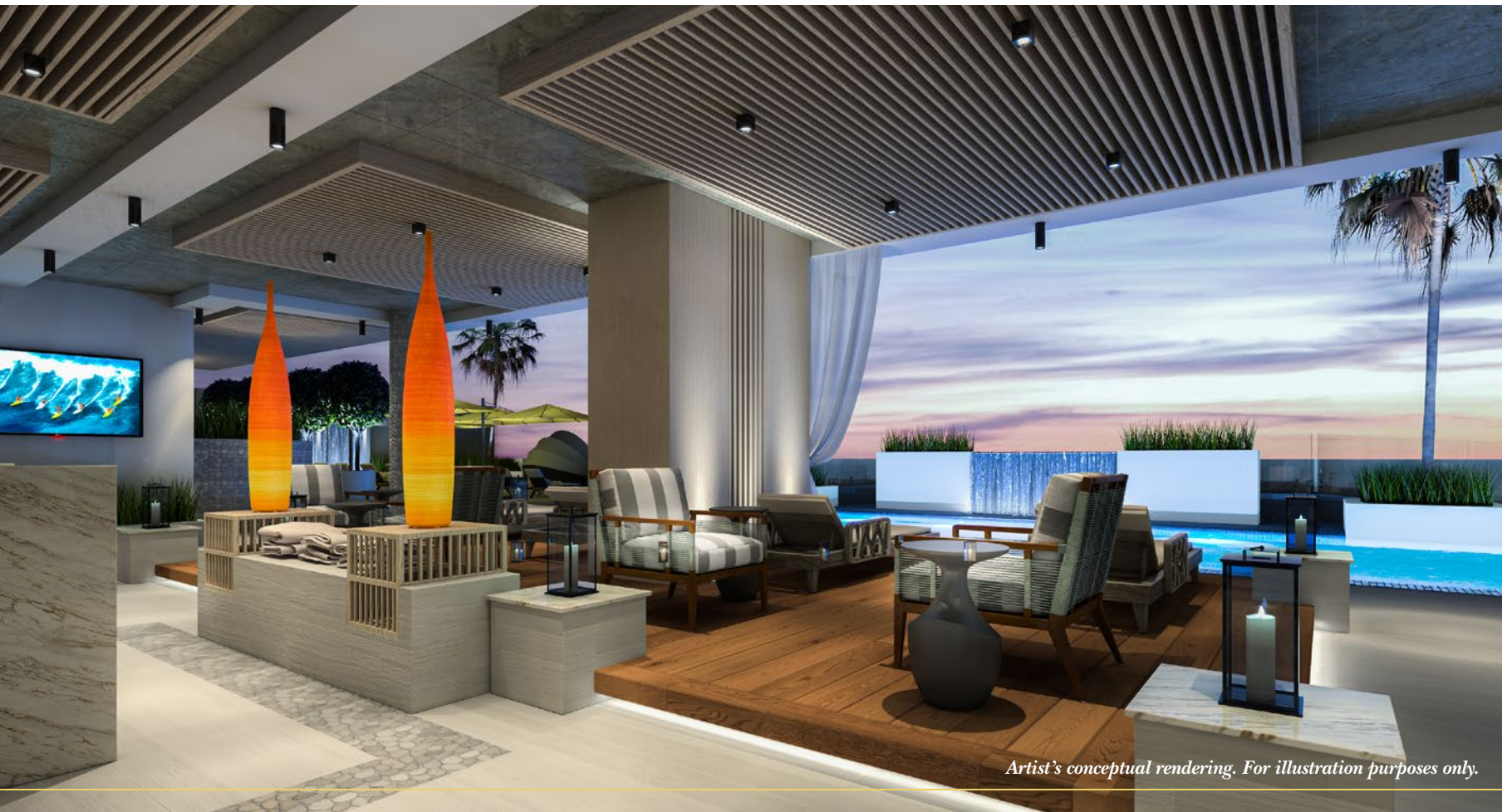
Artist's conceptual rendering. For illustration purposes only.