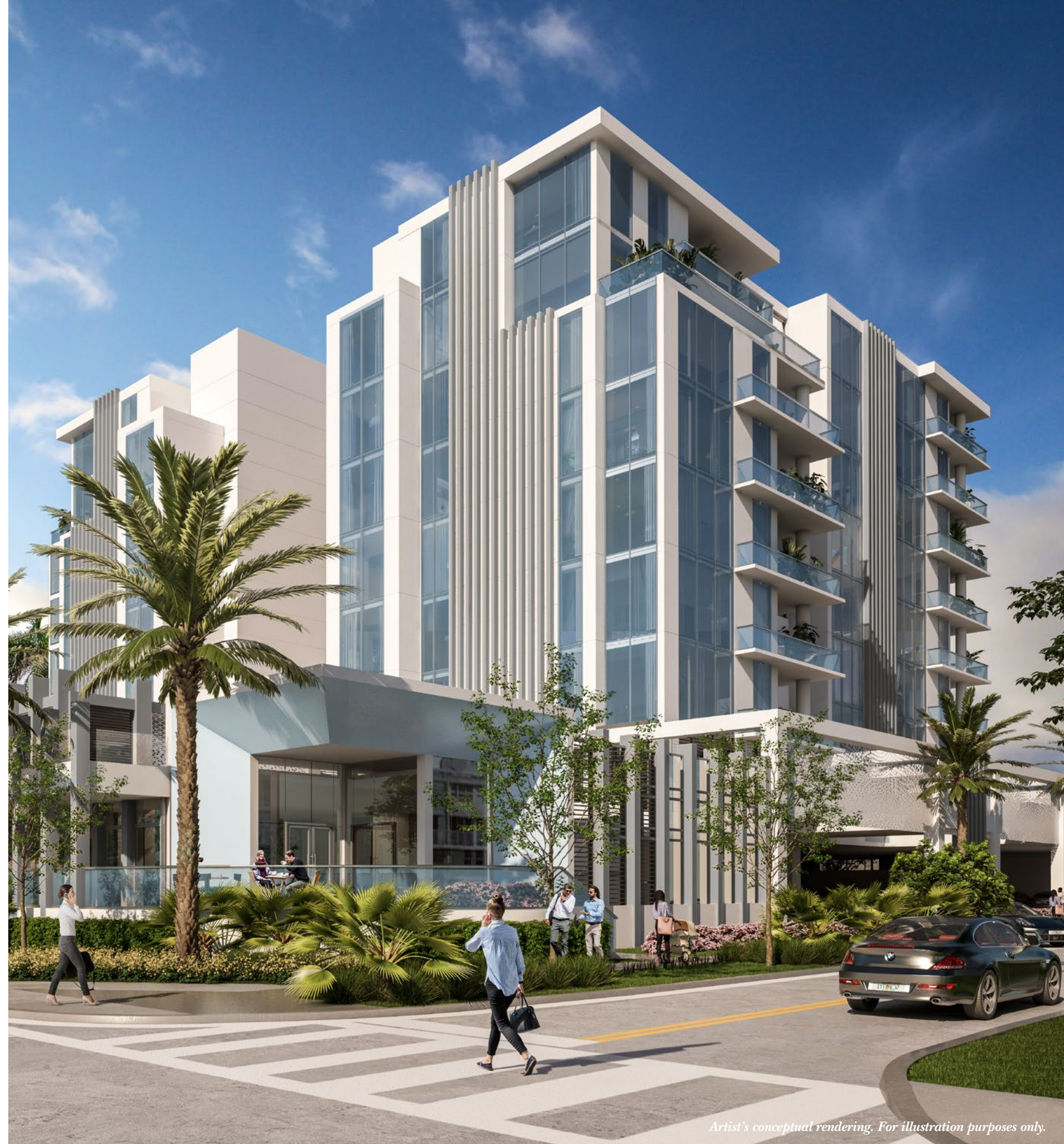
Artist's conceptual rendering. For illustration purposes only.

Salato's location at the corner of Briny Ave and SE Fourth St. in Pompano Beach is simply perfection. It's a connection to all that Pompano Beach has to offer.