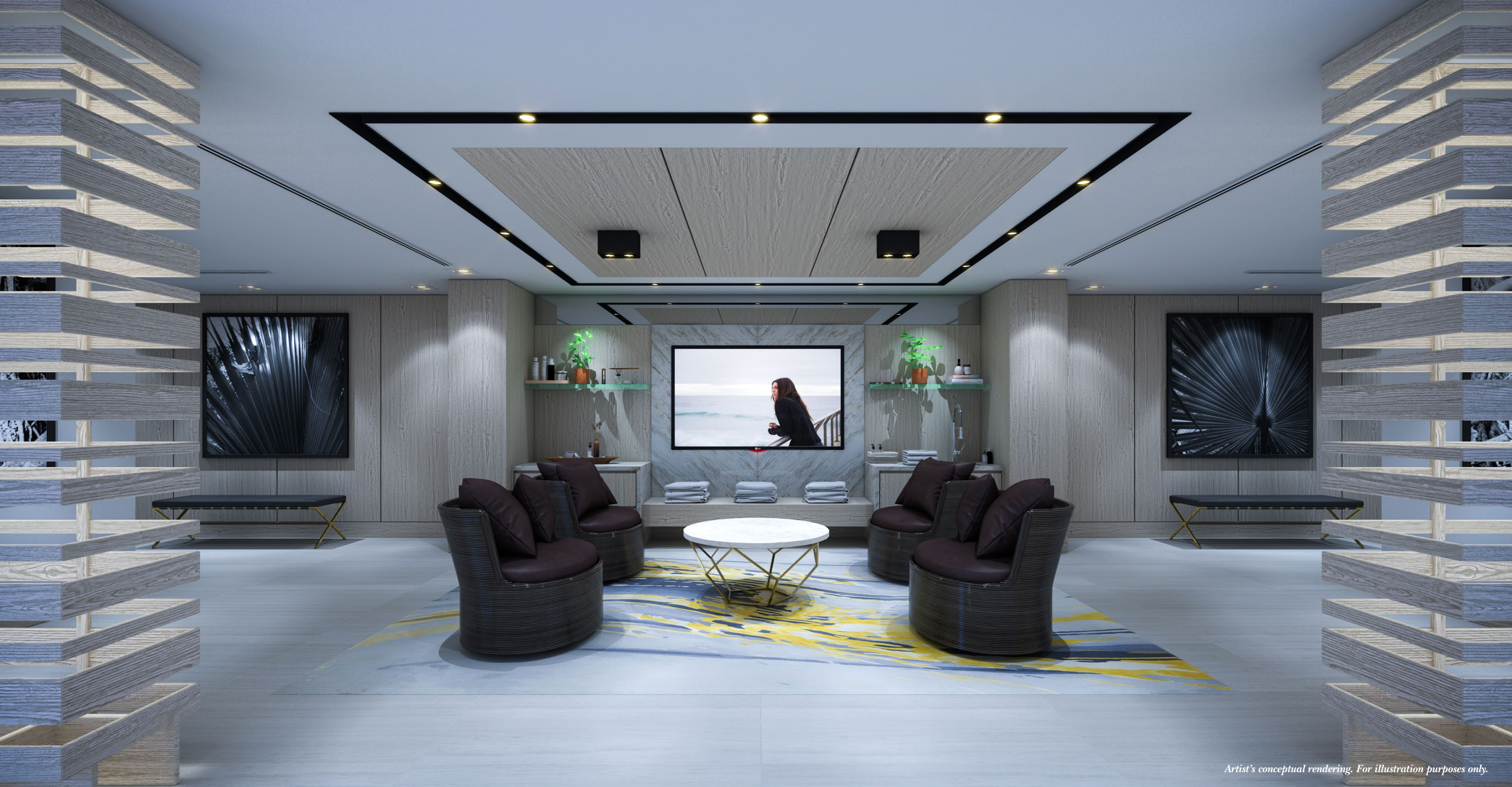
Artist's conceptual rendering. For illustration purposes only.