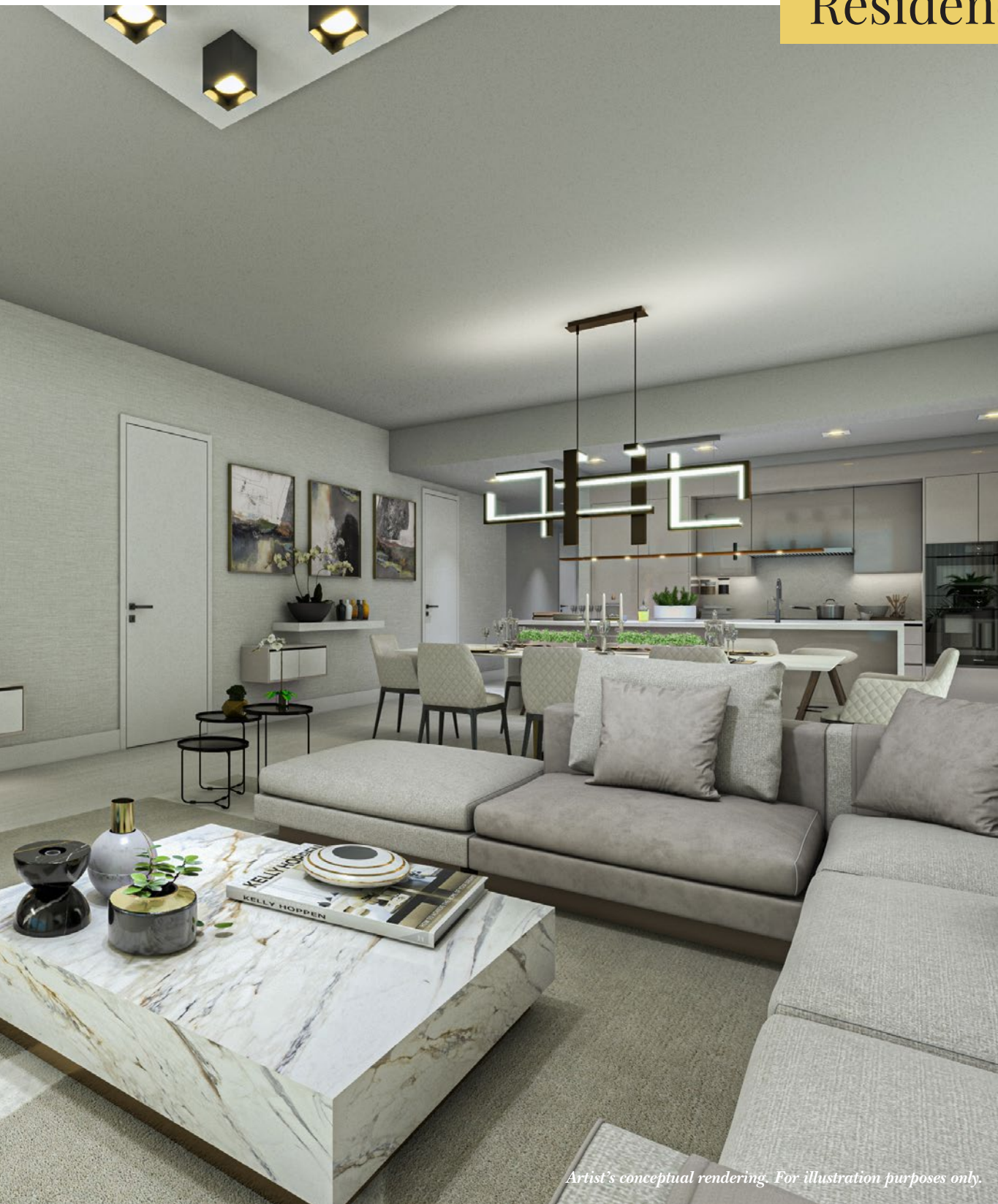
Artist's conceptual rendering. For illustration purposes only.